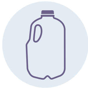
Gallon (gal) Liter (l)