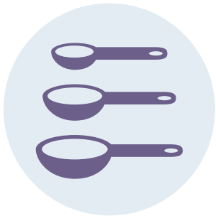
Teaspoon/Tsp (t) Tablespoon /Tbsp (T)