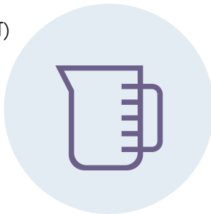
Ounce (oz) Fluid Ounce (fl oz)