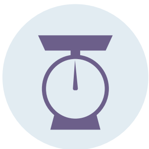
Pound (lb) Gram (g)