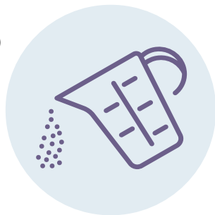
Cup (c) Pint (pt) Quart (qt)